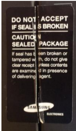
Figure 3 - Security Seal (Black)