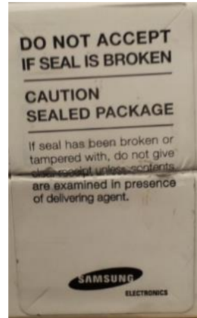
Figure 4 - Security Seal (White)